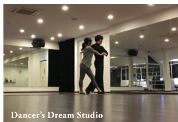
Dancer's Dream Studio

For kids who love to move, Dancer's Dream Studio's Latin dance classes are the perfect holiday activity! Their holistic dance curriculum focuses on a balance between skills and play-based learning, where creative ideation is encouraged. The confidence-building element of the classes are great for children who want to challenge themselves to achieve more!