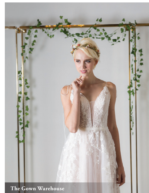
The Gown Warehouse