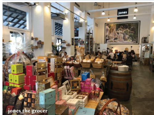
jones the grocer