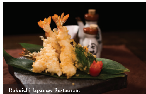
Rakuichi Japanese Restaurant

WHERE Blk 10 Dempsey Road, S(247700) CONTACT 6474 2143