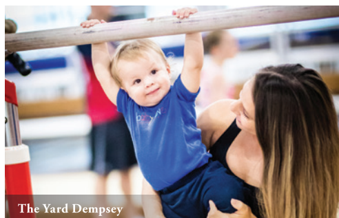
The Yard Dempsey