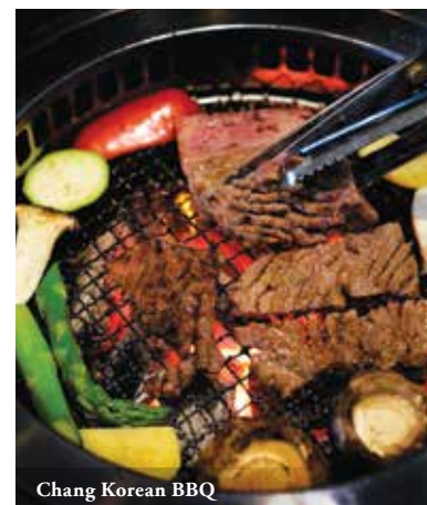
Chang Korean BBQ