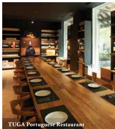
TUGA Portuguese Restaurant

Missing your year-end holiday travels? We've got you covered with the wide selection of international cuisine at this charming dining enclave.