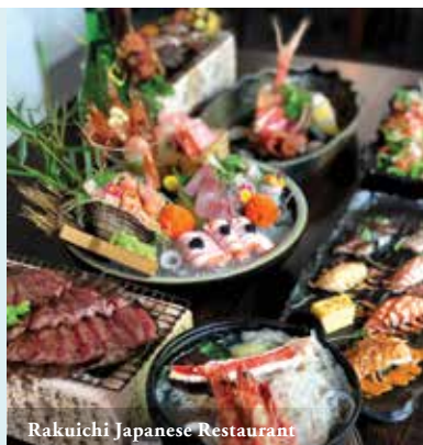
Rakuichi Japanese Restaurant

WHERE Blk 10 Dempsey Road, Singapore 247700 CONTACT 6474 2143