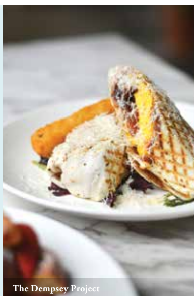
The Dempsey Project

WHERE Blk 9 Dempsey Road, Singapore 247697 CONTACT 6476 1518