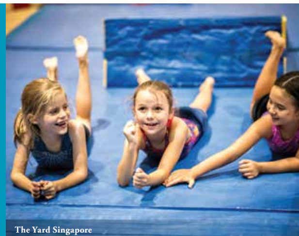
The Yard Singapore

If you suspect that your little one might be a potential elite athlete, send them to The Yard Singapore . Sporty or not, your child will love the gymnastics, trampoline, parkour and freestyle programmes designed for maximum fun, suitable for all age groups and ability levels! Check out The Yard's five-day intensive camps – a mix of fun and training to get the best out of school holiday time. Choose from your kid's favourite activity, whether it is recreational or competitive, half day single-activity or full day multi-activity camps.