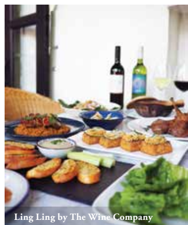
Ling Ling by The Wine Company

WHERE Blk 8 Dempsey Road, Singapore 247696 CONTACT 6261 5123