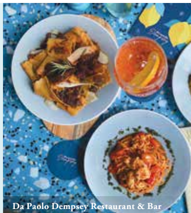
Da Paolo Dempsey Restaurant & Bar

WHERE Blk 8 Dempsey Road, #01-13, Singapore 247696 CONTACT 6261 3128